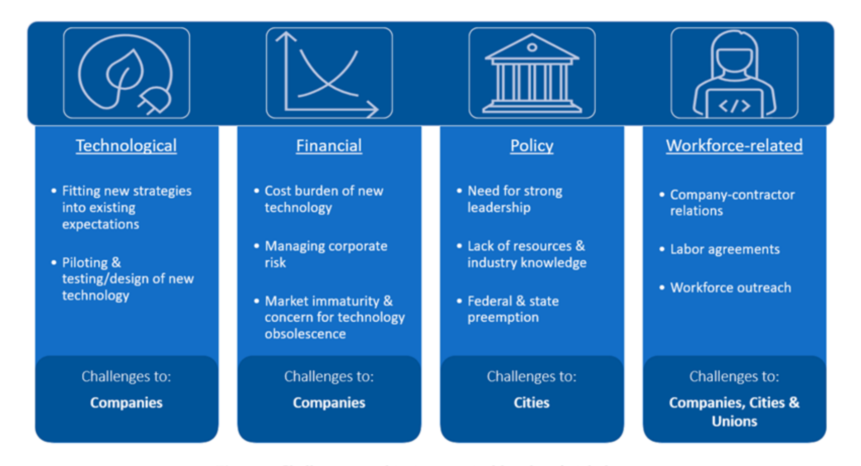
Figure 1. Challenges to achieving sustainable urban freight by category.